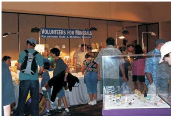
VFM/FGMS 2008 San Diego County Fair Booth-

If we can get donations of minerals and put minerals into grab bags, we can cut down the cost. We have grab bag making day on Thursday at our building and the museum is open also on that day. This is a great way for a beginner to learn about minerals where you handle the mineral and learn the name. Also, our Beading Brigade meets