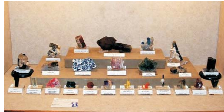
SD Fair 2008 Mike Evans exhibit, 1st place