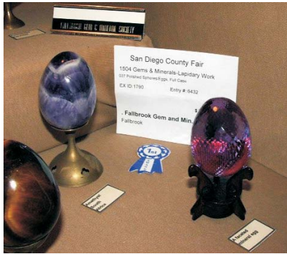
SD Fair 2008 FGMS egg case 1st prize.