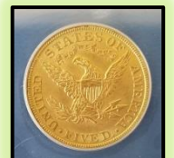
1905 LIBERTY HALF EAGLE $5 GOLD COIN Donated by Jim Kerry

TICKETS - $5 each or 5 for $20! 4 PM DRAWING! Winners need not be present!