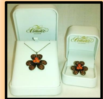
SPESSARTITE GARNET, FIRE OPAL & SMOKY QUARTZ STERLING SILVER PENDANT & RING Donated by Pala International, Inc.