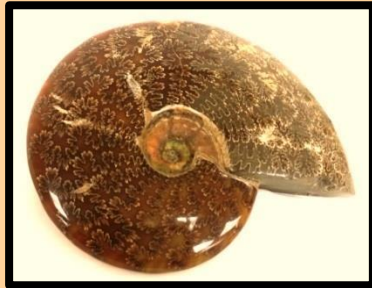
POLISHED FOSSIL AMMONITE, 8"W x 6"H (MOROCCO) Donated by FGMS