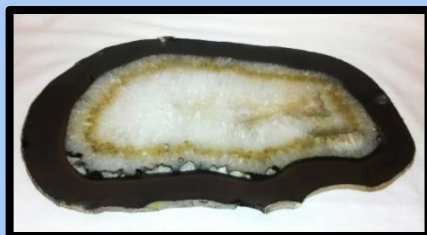
POLISHED NATURAL AGATE SLAB (14"W x 8"H) Donated by FGMS