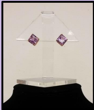
FACETED AMETHYST STUD EARRINGS 14KT YELLOW GOLD POSTS Donated by Cal & Kerith Graeber, Cal Graeber Minerals & Gems